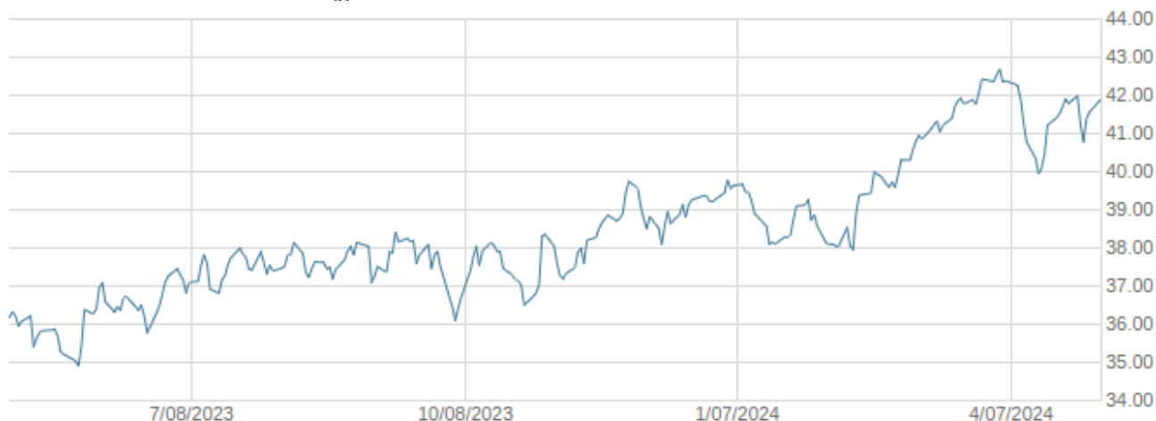
— ETRACS Alerian Midstream Energy Index ETN

The above graph illustrates the historical indicative values of the ETN during the period selected. The indicative value is the approximate intrinsic economic value of the ETN as of a particular time and date. The actual trading price of the ETN may be different from its indicative value. The secondary market trading price of the ETNs may be at, above, or below the indicative value of the ETN. Historical performance of the ETN is not an indication of future performance of the ETN. Future performance of the ETN may differ significantly from its historical performance, either positively or negatively.