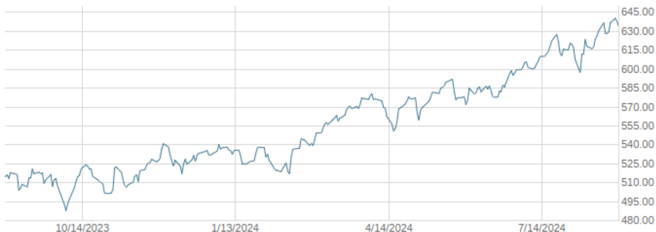
— Alerian Midstream Energy Index