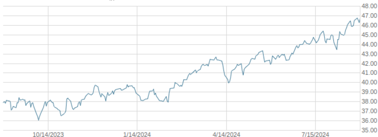
— ETRACS Alerian Midstream Energy Index ETN

The above graph illustrates the historical indicative values of the ETN during the period selected. The indicative value is the approximate intrinsic economic value of the ETN as of a particular time and date. The actual trading price of the ETN may be different from its indicative value. The secondary market trading price of the ETNs may be at, above, or below the indicative value of the ETN. Historical performance of the ETN is not an indication of future performance of the ETN. Future performance of the ETN may differ significantly from its historical performance, either positively or negatively.