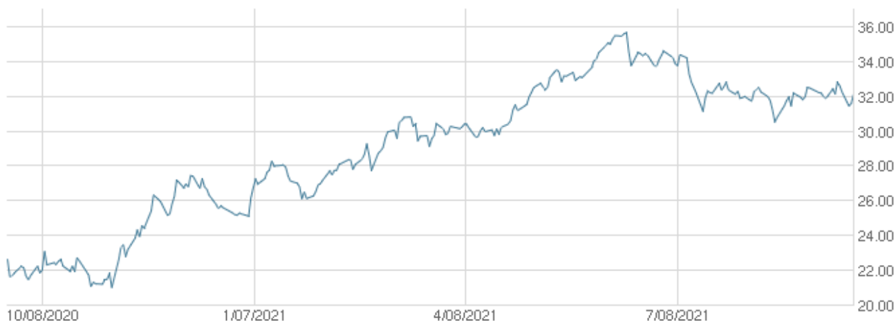
— ETRACS Alerian Midstream Energy Index ETN

The above graph illustrates the historical indicative values of the ETN during the period selected. The indicative value is the approximate intrinsic economic value of the ETN as of a particular time and date. The actual trading price of the ETN may be different from its indicative value. The secondary market trading price of the ETNs may be at, above, or below the indicative value of the ETN. Historical performance of the ETN is not an indication of future performance of the ETN. Future performance of the ETN may differ significantly from its historical performance, either positively or negatively.