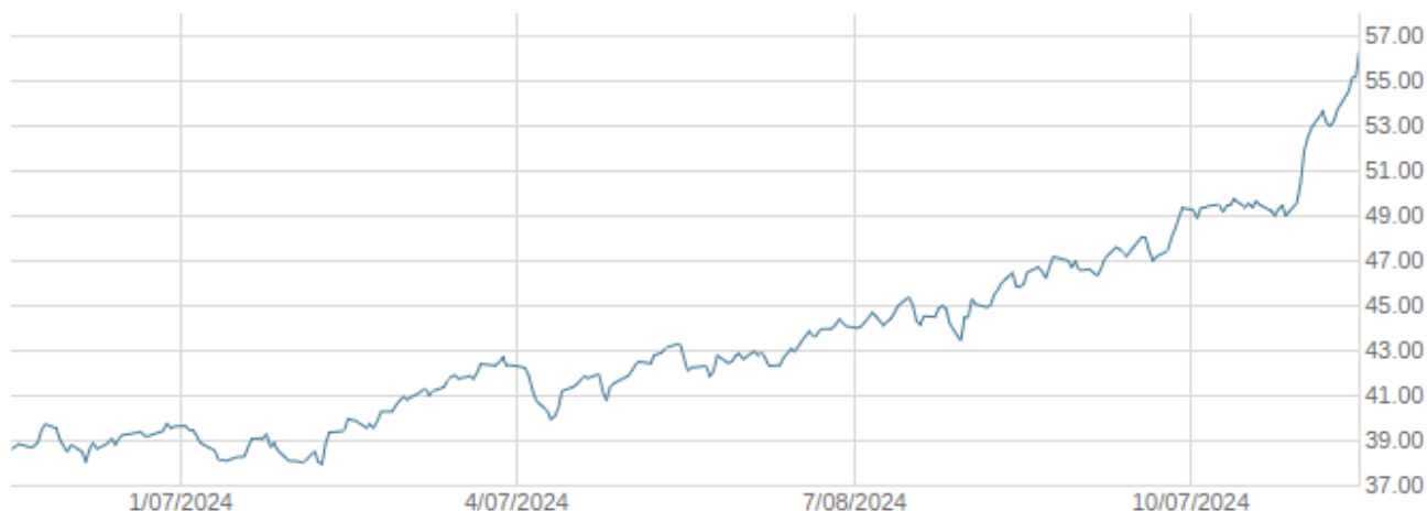
— ETRACS Alerian Midstream Energy Index ETN

The above graph illustrates the historical indicative values of the ETN during the period selected. The indicative value is the approximate intrinsic economic value of the ETN as of a particular time and date. The actual trading price of the ETN may be different from its indicative value. The secondary market trading price of the ETNs may be at, above, or below the indicative value of the ETN. Historical performance of the ETN is not an indication of future performance of the ETN. Future performance of the ETN may differ significantly from its historical performance, either positively or negatively.