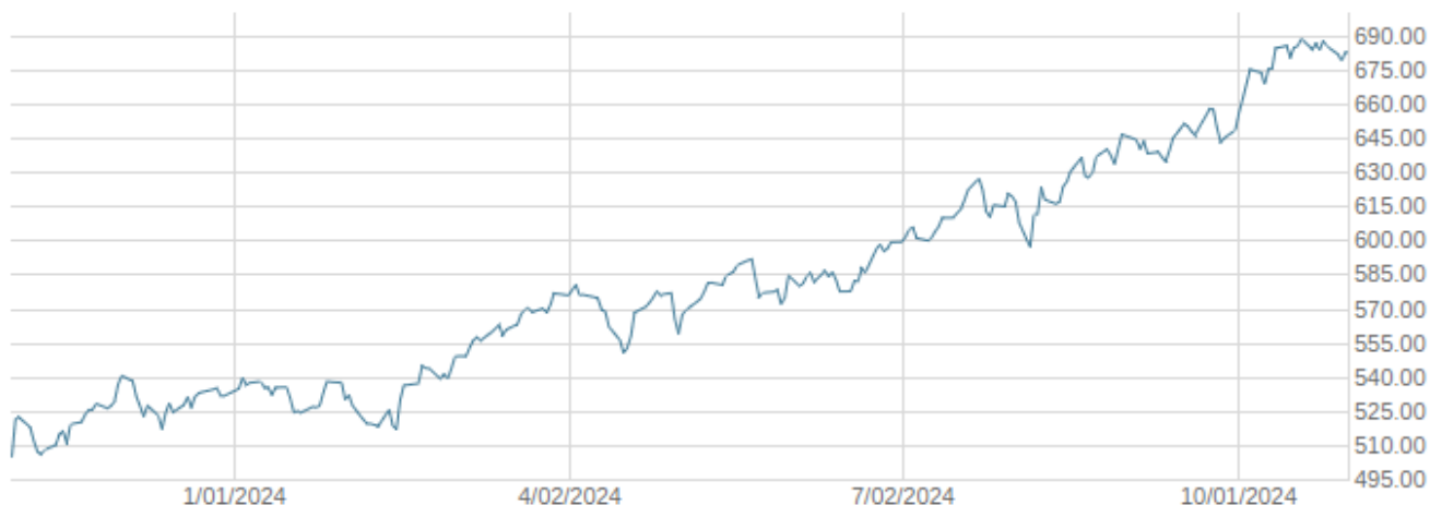
— Alerian Midstream Energy Index