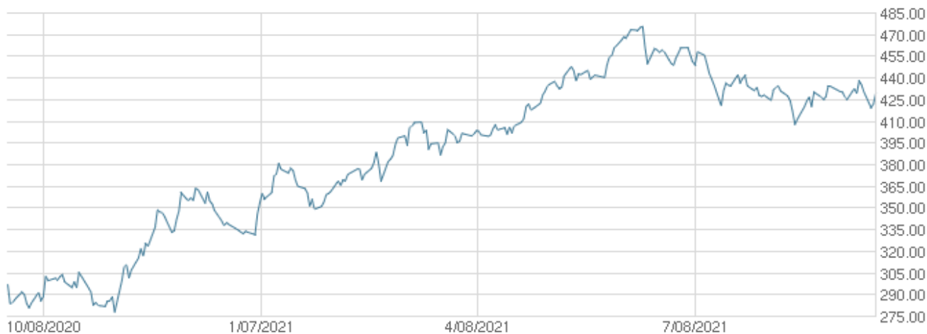
— Alerian Midstream Energy Index