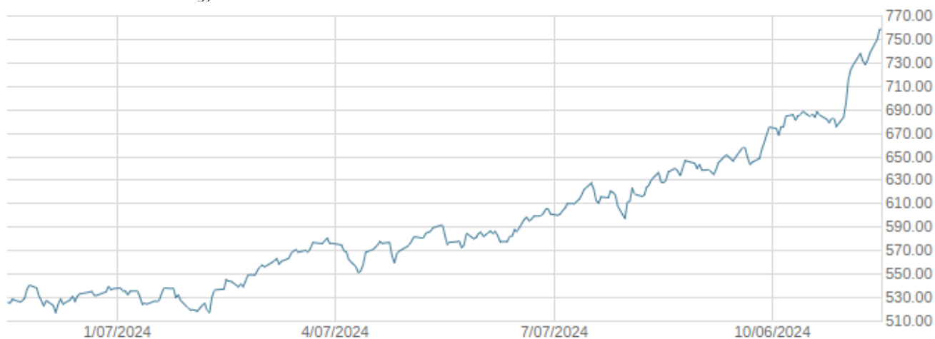
— Alerian Midstream Energy Index