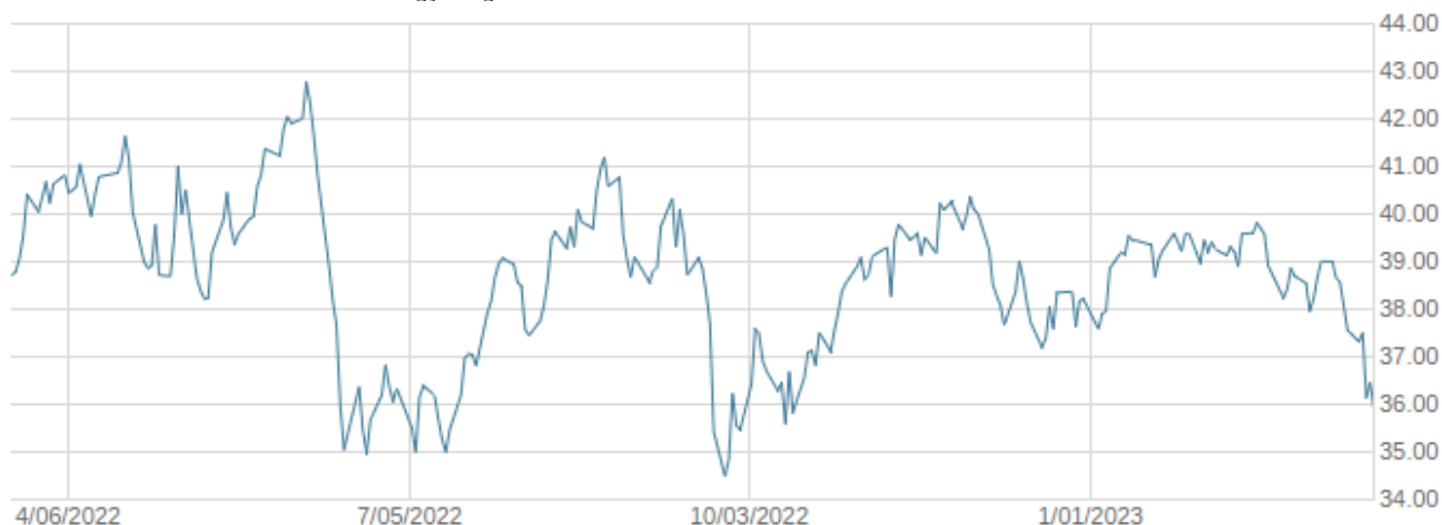
— ETRACS Alerian Midstream Energy High Dividend Index ETN

The above graph illustrates the historical indicative values of the ETN during the period selected. The indicative value is the approximate intrinsic economic value of the ETN as of a particular time and date. The actual trading price of the ETN may be different from its indicative value. The secondary market trading price of the ETNs may be at, above, or below the indicative value of the ETN. Historical performance of the ETN is not an indication of future performance of the ETN. Future performance of the ETN may differ significantly from its historical performance, either positively or negatively.