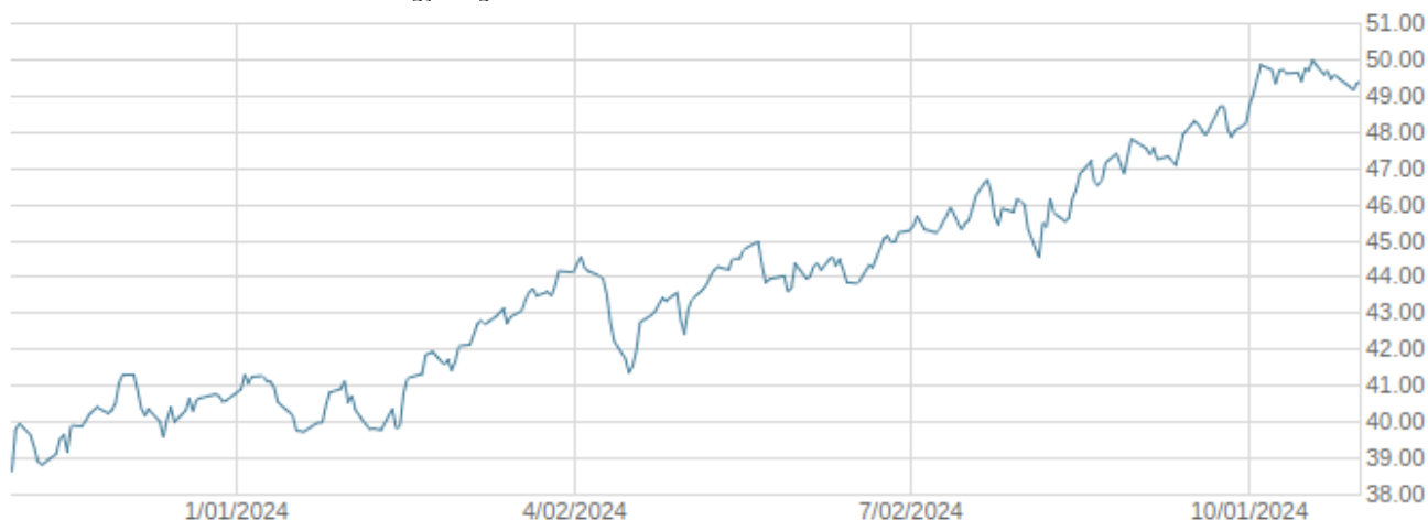
— ETRACS Alerian Midstream Energy High Dividend Index ETN

The above graph illustrates the historical indicative values of the ETN during the period selected. The indicative value is the approximate intrinsic economic value of the ETN as of a particular time and date. The actual trading price of the ETN may be different from its indicative value. The secondary market trading price of the ETNs may be at, above, or below the indicative value of the ETN. Historical performance of the ETN is not an indication of future performance of the ETN. Future performance of the ETN may differ significantly from its historical performance, either positively or negatively.