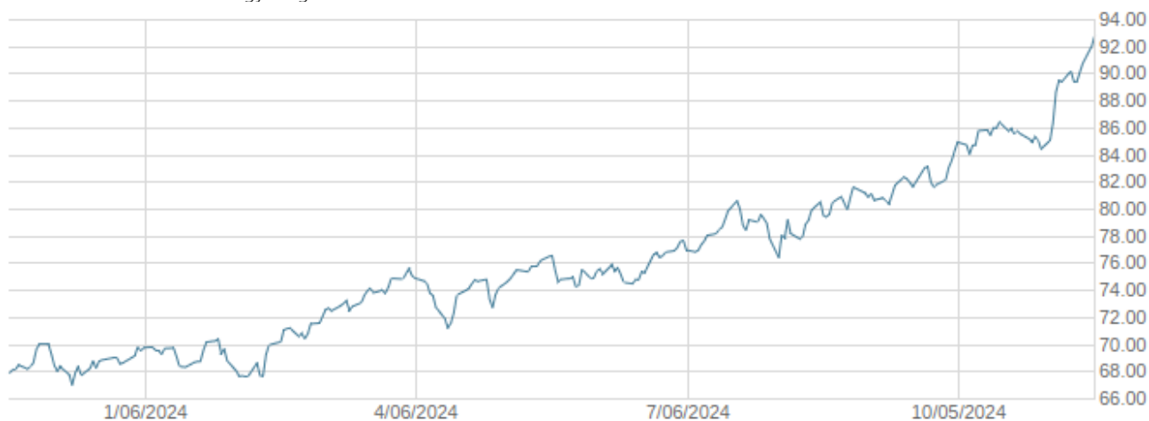
— Alerian Midstream Energy High Dividend Index