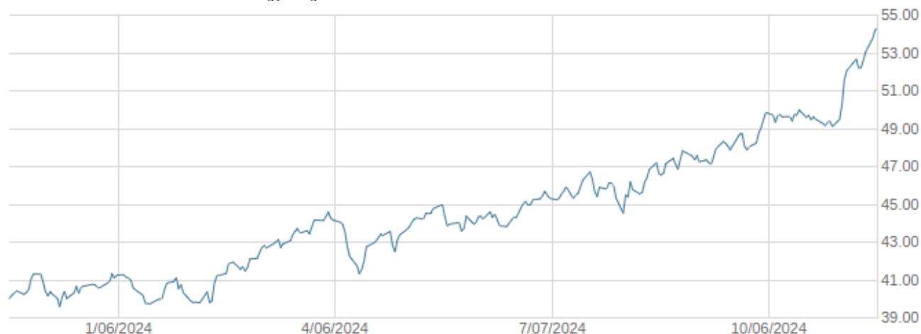
— ETRACS Alerian Midstream Energy High Dividend Index ETN

The above graph illustrates the historical indicative values of the ETN during the period selected. The indicative value is the approximate intrinsic economic value of the ETN as of a particular time and date. The actual trading price of the ETN may be different from its indicative value. The secondary market trading price of the ETNs may be at, above, or below the indicative value of the ETN. Historical performance of the ETN is not an indication of future performance of the ETN. Future performance of the ETN may differ significantly from its historical performance, either positively or negatively.