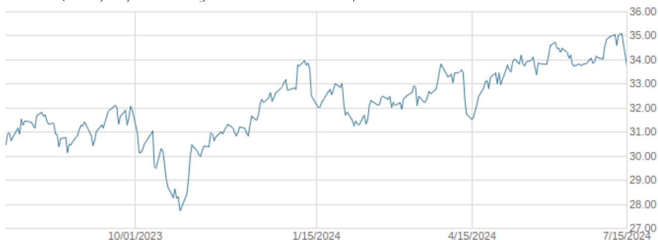
— ETRACS Quarterly Pay 1.5x Leveraged MarketVector BDC Liquid Index ETN

The above graph illustrates the historical indicative values of the ETN during the period selected. The indicative value is the approximate intrinsic economic value of the ETN as of a particular time and date. The actual trading price of the ETN may be different from its indicative value. The secondary market trading price of the ETNs may be at, above, or below the indicative value of the ETN. Historical performance of the ETN is not an indication of future performance of the ETN. Future performance of the ETN may differ significantly from its historical performance, either positively or negatively.