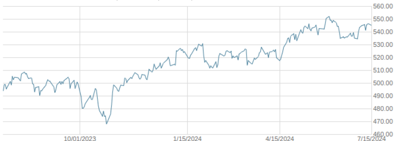
— MarketVector US Business Development Companies Liquid Index

Source: UBS Investment Bank, publicly available data.