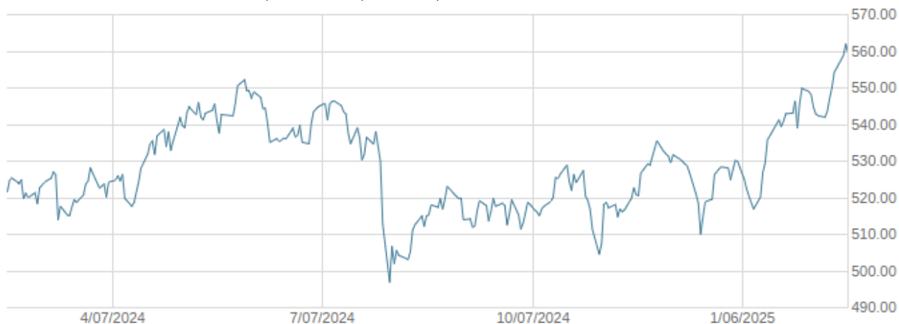
— MarketVector US Business Development Companies Liquid Index

Source: UBS Investment Bank, publicly available data.