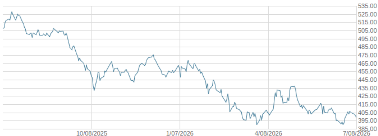
— MarketVector US Business Development Companies Liquid Index

Source: UBS Investment Bank, publicly available data.