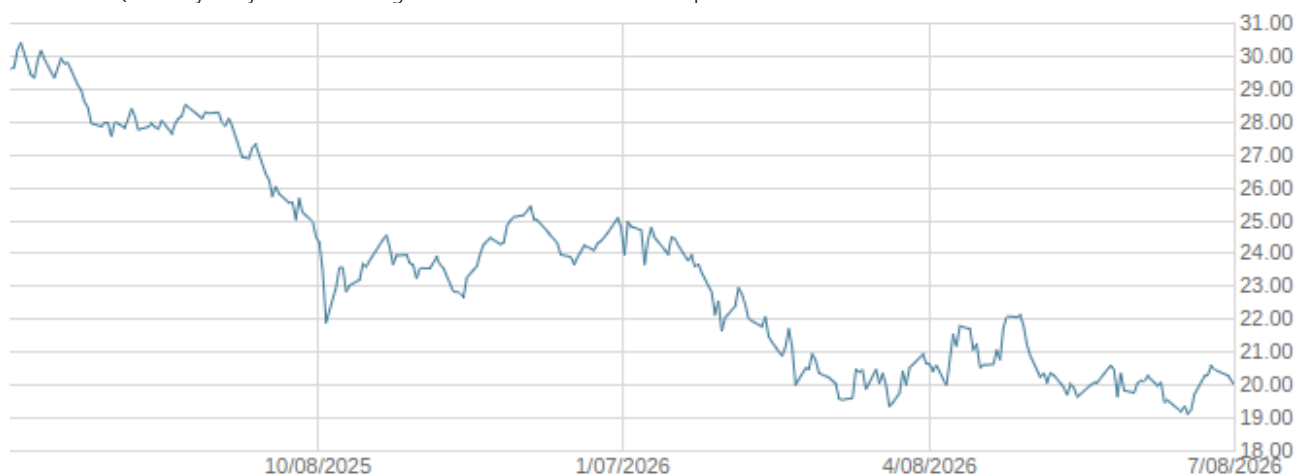
— ETRACS Quarterly Pay 1.5x Leveraged MarketVector BDC Liquid Index ETN

The above graph illustrates the historical indicative values of the ETN during the period selected. The indicative value is the approximate intrinsic economic value of the ETN as of a particular time and date. The actual trading price of the ETN may be different from its indicative value. The secondary market trading price of the ETNs may be at, above, or below the indicative value of the ETN. Historical performance of the ETN is not an indication of future performance of the ETN. Future performance of the ETN may differ significantly from its historical performance, either positively or negatively.