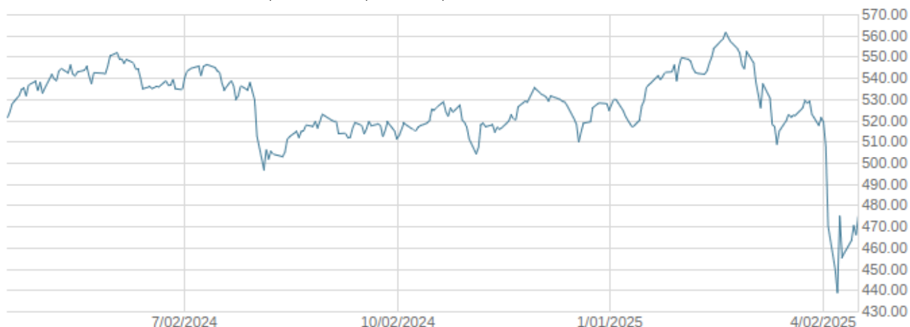
— MarketVector US Business Development Companies Liquid Index

Source: UBS Investment Bank, publicly available data.