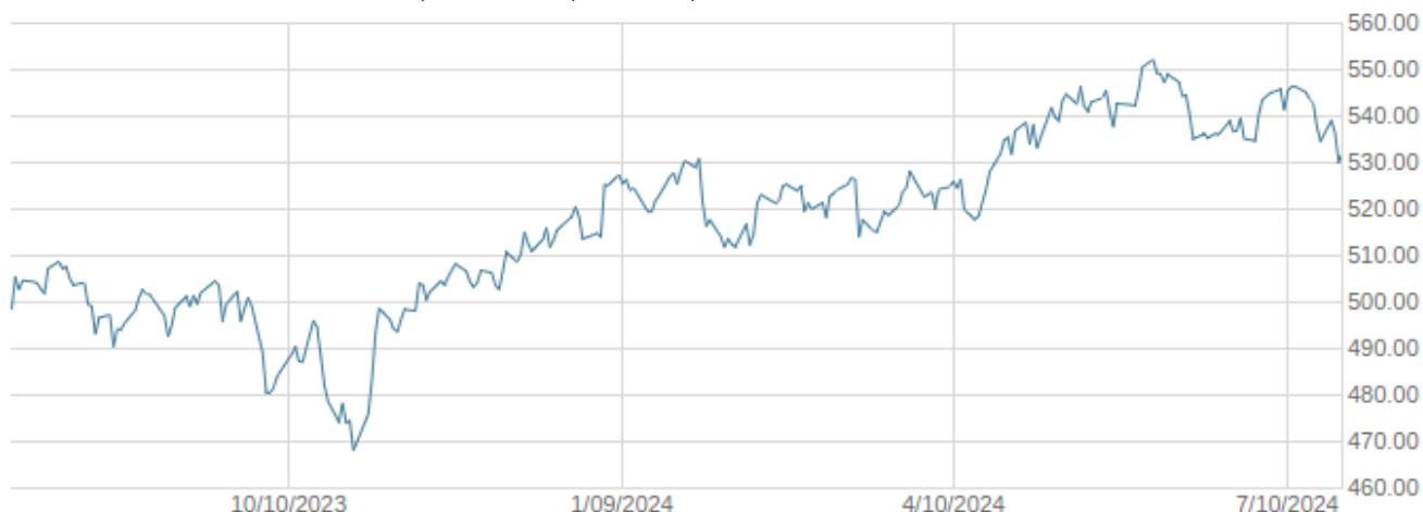
— MarketVector US Business Development Companies Liquid Index

Source: UBS Investment Bank, publicly available data.