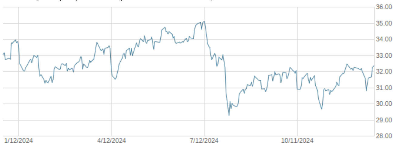
— ETRACS Quarterly Pay 1.5x Leveraged MarketVector BDC Liquid Index ETN

The above graph illustrates the historical indicative values of the ETN during the period selected. The indicative value is the approximate intrinsic economic value of the ETN as of a particular time and date. The actual trading price of the ETN may be different from its indicative value. The secondary market trading price of the ETNs may be at, above, or below the indicative value of the ETN. Historical performance of the ETN is not an indication of future performance of the ETN. Future performance of the ETN may differ significantly from its historical performance, either positively or negatively.