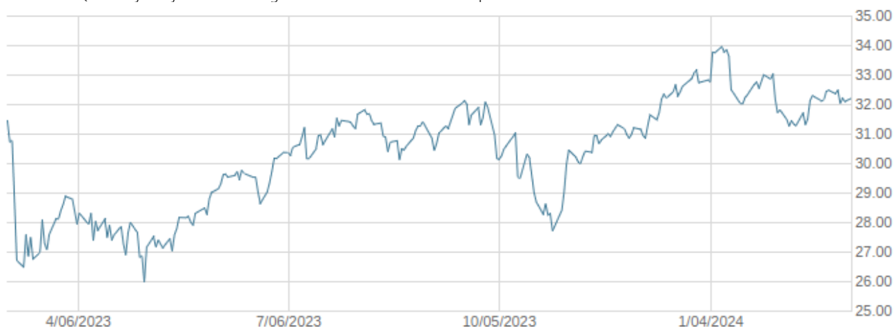
— ETRACS Quarterly Pay 1.5x Leveraged MarketVector BDC Liquid Index ETN

The above graph illustrates the historical indicative values of the ETN during the period selected. The indicative value is the approximate intrinsic economic value of the ETN as of a particular time and date. The actual trading price of the ETN may be different from its indicative value. The secondary market trading price of the ETNs may be at, above, or below the indicative value of the ETN. Historical performance of the ETN is not an indication of future performance of the ETN. Future performance of the ETN may differ significantly from its historical performance, either positively or negatively.