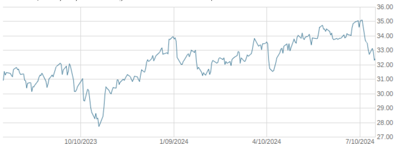
— ETRACS Quarterly Pay 1.5x Leveraged MarketVector BDC Liquid Index ETN

The above graph illustrates the historical indicative values of the ETN during the period selected. The indicative value is the approximate intrinsic economic value of the ETN as of a particular time and date. The actual trading price of the ETN may be different from its indicative value. The secondary market trading price of the ETNs may be at, above, or below the indicative value of the ETN. Historical performance of the ETN is not an indication of future performance of the ETN. Future performance of the ETN may differ significantly from its historical performance, either positively or negatively.