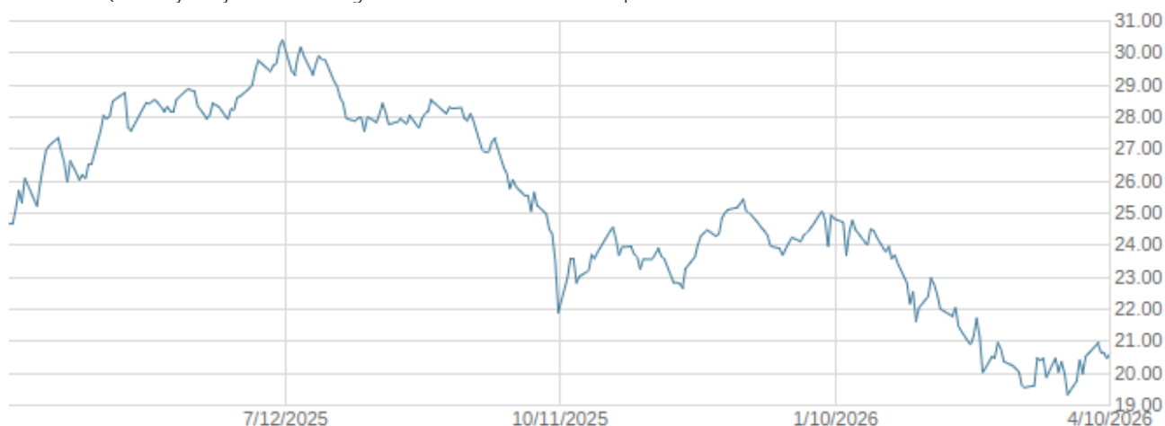
— ETRACS Quarterly Pay 1.5x Leveraged MarketVector BDC Liquid Index ETN

The above graph illustrates the historical indicative values of the ETN during the period selected. The indicative value is the approximate intrinsic economic value of the ETN as of a particular time and date. The actual trading price of the ETN may be different from its indicative value. The secondary market trading price of the ETNs may be at, above, or below the indicative value of the ETN. Historical performance of the ETN is not an indication of future performance of the ETN. Future performance of the ETN may differ significantly from its historical performance, either positively or negatively.