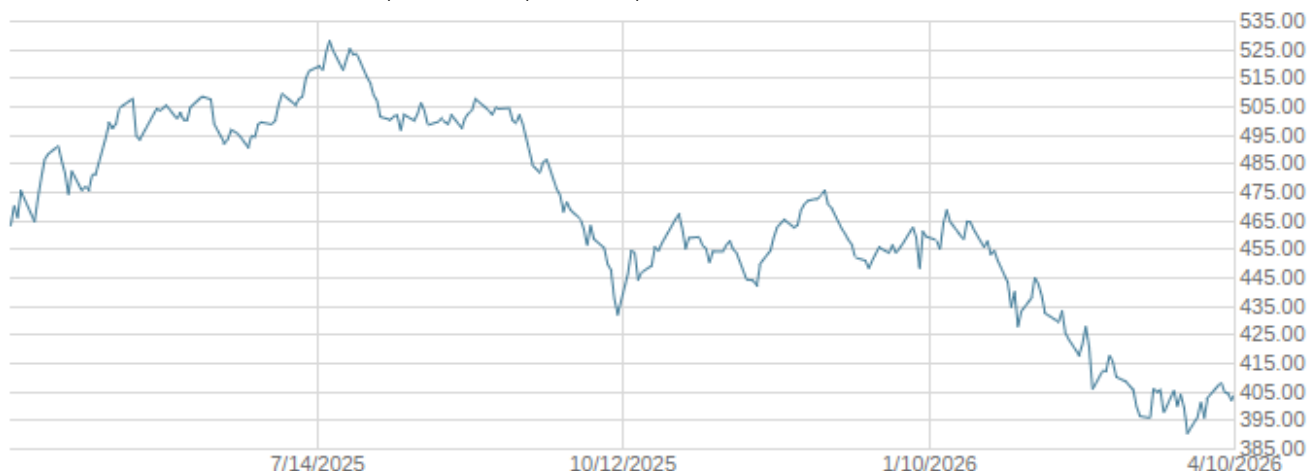
— MarketVector US Business Development Companies Liquid Index

Source: UBS Investment Bank, publicly available data.