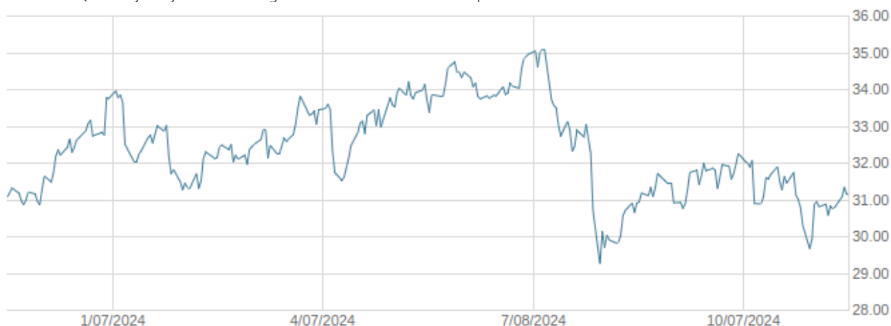
— ETRACS Quarterly Pay 1.5x Leveraged MarketVector BDC Liquid Index ETN

The above graph illustrates the historical indicative values of the ETN during the period selected. The indicative value is the approximate intrinsic economic value of the ETN as of a particular time and date. The actual trading price of the ETN may be different from its indicative value. The secondary market trading price of the ETNs may be at, above, or below the indicative value of the ETN. Historical performance of the ETN is not an indication of future performance of the ETN. Future performance of the ETN may differ significantly from its historical performance, either positively or negatively.