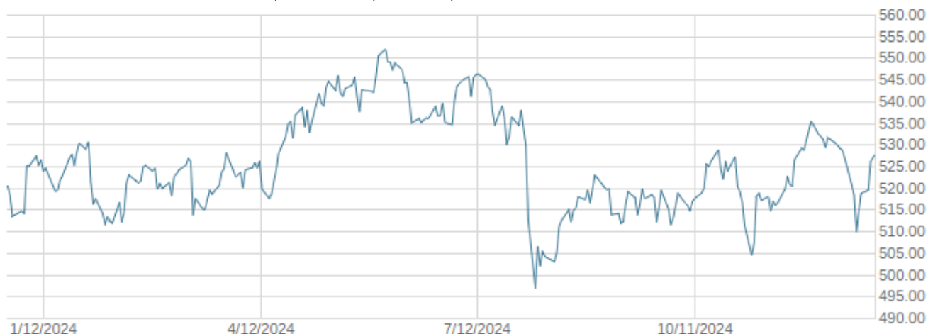
— MarketVector US Business Development Companies Liquid Index

Source: UBS Investment Bank, publicly available data.