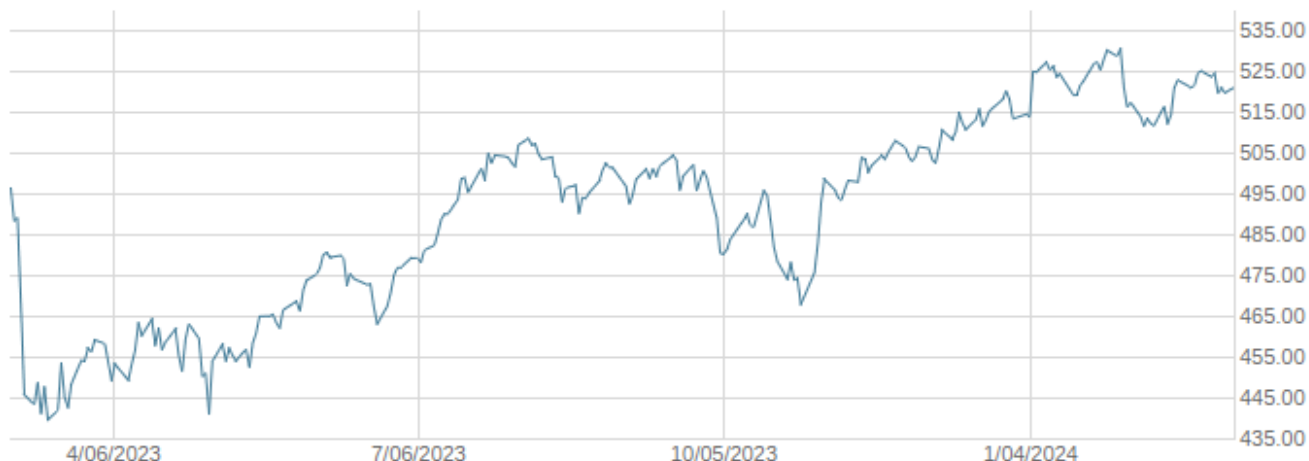
— MarketVector US Business Development Companies Liquid Index

Source: UBS Investment Bank, publicly available data.