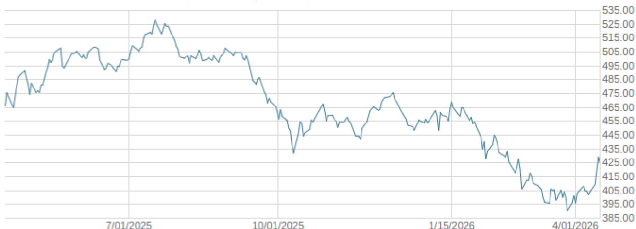
— MarketVector US Business Development Companies Liquid Index

Source: UBS Investment Bank, publicly available data.