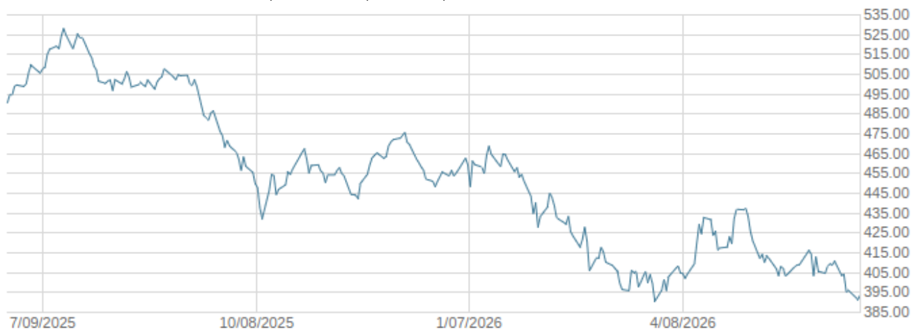
— MarketVector US Business Development Companies Liquid Index

Source: UBS Investment Bank, publicly available data.