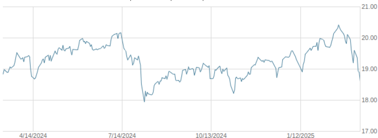
— ETRACS MarketVector Business Development Companies Liquid Index ETN

The above graph illustrates the historical indicative values of the ETN during the period selected. The indicative value is the approximate intrinsic economic value of the ETN as of a particular time and date. The actual trading price of the ETN may be different from its indicative value. The secondary market trading price of the ETNs may be at, above, or below the indicative value of the ETN. Historical performance of the ETN is not an indication of future performance of the ETN. Future performance of the ETN may differ significantly from its historical performance, either positively or negatively.