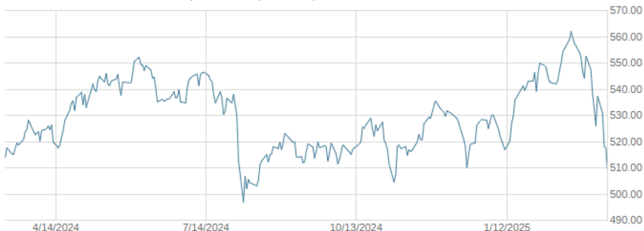
— MarketVector US Business Development Companies Liquid Index

Source: UBS Investment Bank, publicly available data.