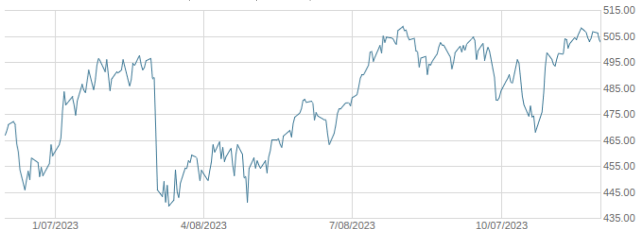
— MarketVector US Business Development Companies Liquid Index

Source: UBS Investment Bank, publicly available data.