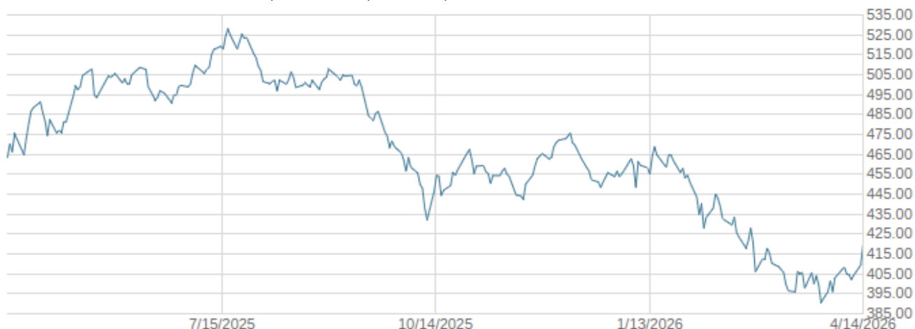
— MarketVector US Business Development Companies Liquid Index

Source: UBS Investment Bank, publicly available data.