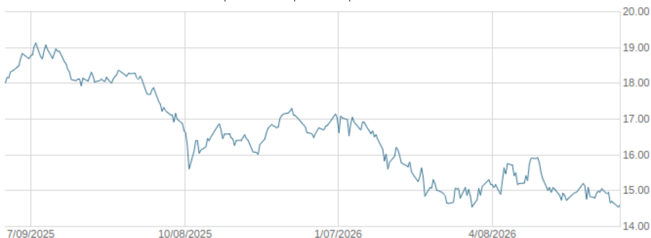
— ETRACS MarketVector Business Development Companies Liquid Index ETN

The above graph illustrates the historical indicative values of the ETN during the period selected. The indicative value is the approximate intrinsic economic value of the ETN as of a particular time and date. The actual trading price of the ETN may be different from its indicative value. The secondary market trading price of the ETNs may be at, above, or below the indicative value of the ETN. Historical performance of the ETN is not an indication of future performance of the ETN. Future performance of the ETN may differ significantly from its historical performance, either positively or negatively.