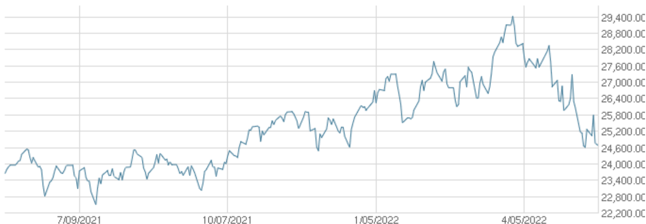
— IFED Large -Cap US TR Equity Index