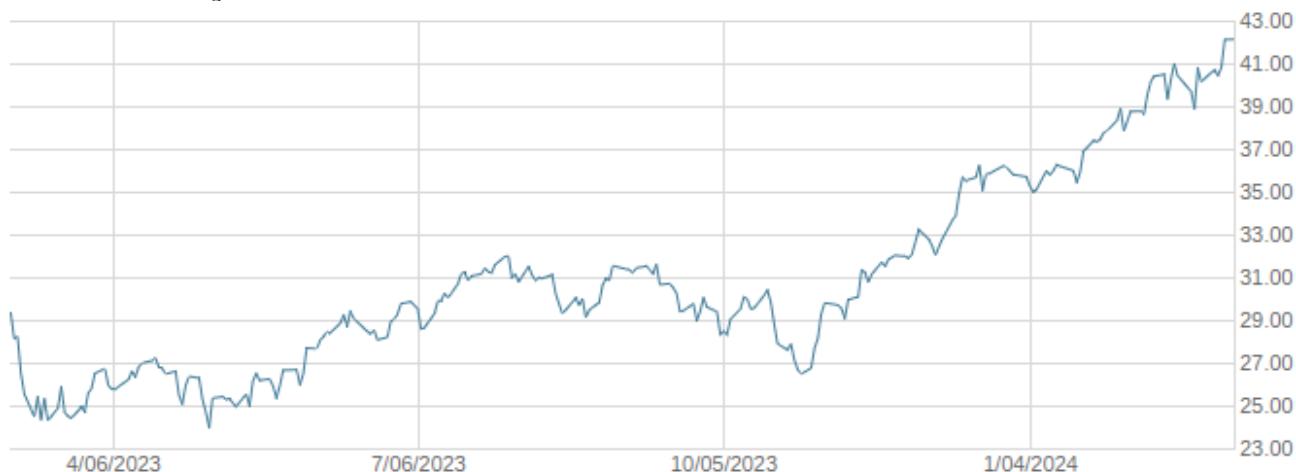
— ETRACS 2x Leveraged IFED Invest with the Fed TR Index ETN

The above graph illustrates the historical indicative values of the ETN during the period selected. The indicative value is the approximate intrinsic economic value of the ETN as of a particular time and date. The actual trading price of the ETN may be different from its indicative value. The secondary market trading price of the ETNs may be at, above, or below the indicative value of the ETN. Historical performance of the ETN is not an indication of future performance of the ETN. Future performance of the ETN may differ significantly from its historical performance, either positively or negatively.