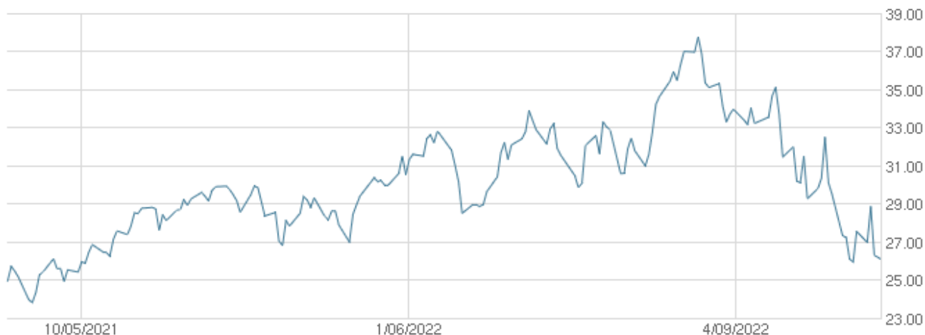
— ETRACS 2x Leveraged IFED Invest with the Fed TR Index ETN

The above graph illustrates the historical indicative values of the ETN during the period selected. The indicative value is the approximate intrinsic economic value of the ETN as of a particular time and date. The actual trading price of the ETN may be different from its indicative value. The secondary market trading price of the ETNs may be at, above, or below the indicative value of the ETN. Historical performance of the ETN is not an indication of future performance of the ETN. Future performance of the ETN may differ significantly from its historical performance, either positively or negatively.