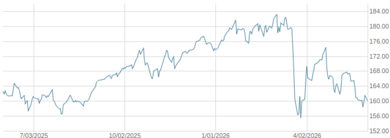
— ETRACS Gold Shares Covered Call ETN

The above graph illustrates the historical indicative values of the ETN during the period selected. The indicative value is the approximate intrinsic economic value of the ETN as of a particular time and date. The actual trading price of the ETN may be different from its indicative value. The secondary market trading price of the ETNs may be at, above, or below the indicative value of the ETN. Historical performance of the ETN is not an indication of future performance of the ETN. Future performance of the ETN may differ significantly from its historical performance, either positively or negatively.