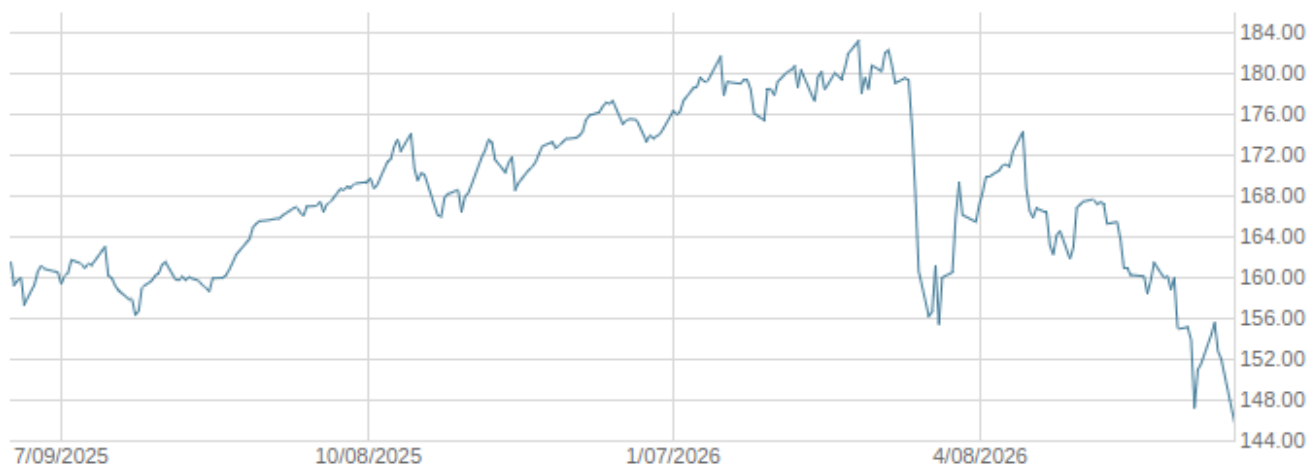
— ETRACS Gold Shares Covered Call ETN

The above graph illustrates the historical indicative values of the ETN during the period selected. The indicative value is the approximate intrinsic economic value of the ETN as of a particular time and date. The actual trading price of the ETN may be different from its indicative value. The secondary market trading price of the ETNs may be at, above, or below the indicative value of the ETN. Historical performance of the ETN is not an indication of future performance of the ETN. Future performance of the ETN may differ significantly from its historical performance, either positively or negatively.