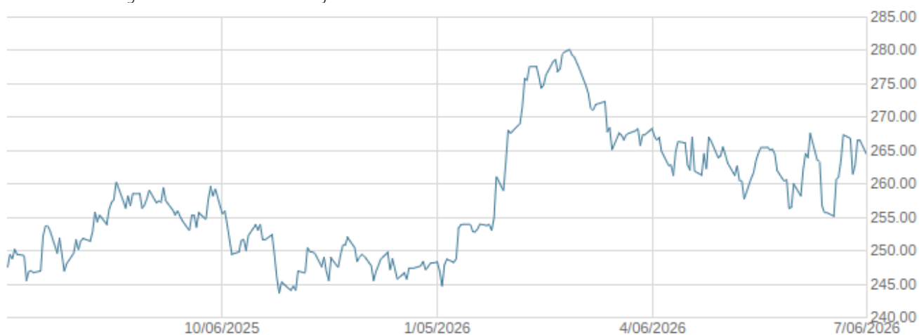
— Solactive US High Dividend Low Volatility Index