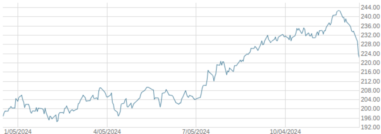
— Solactive US High Dividend Low Volatility Index