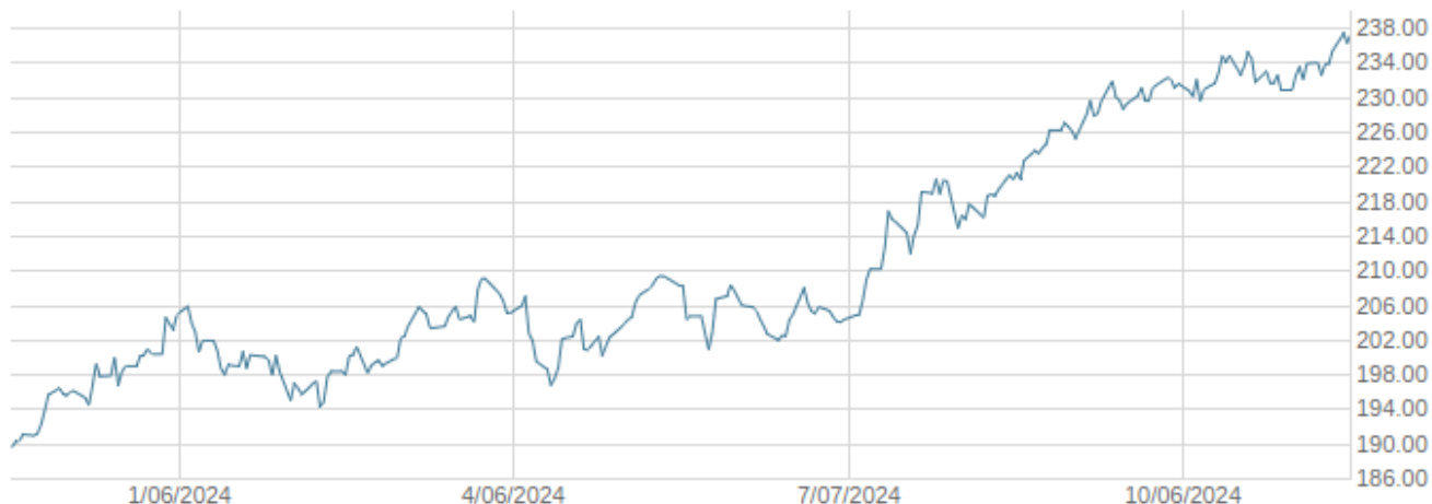
— Solactive US High Dividend Low Volatility Index