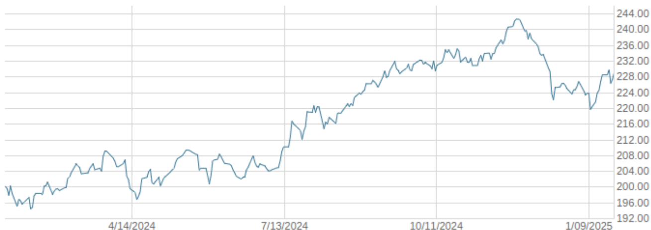
— Solactive US High Dividend Low Volatility Index