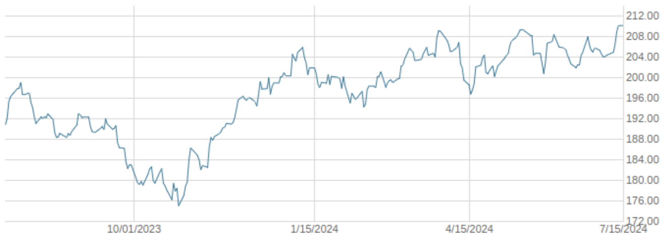
— Solactive US High Dividend Low Volatility Index