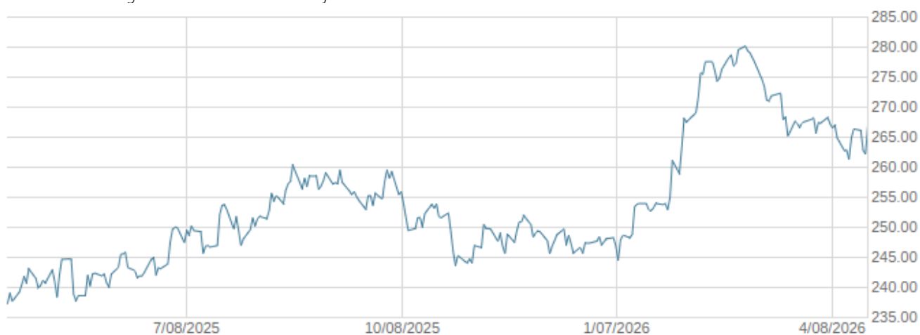
— Solactive US High Dividend Low Volatility Index