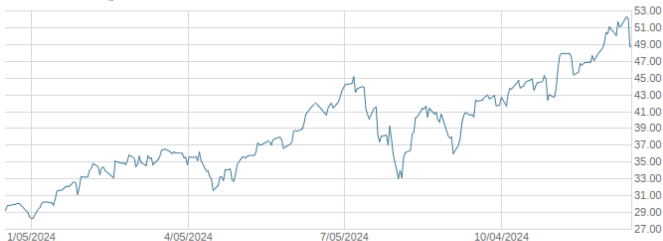
— ETRACS 2x Leveraged US Growth Factor TR ETN

The above graph illustrates the historical indicative values of the ETN during the period selected. The indicative value is the approximate intrinsic economic value of the ETN as of a particular time and date. The actual trading price of the ETN may be different from its indicative value. The secondary market trading price of the ETNs may be at, above, or below the indicative value of the ETN. Historical performance of the ETN is not an indication of future performance of the ETN. Future performance of the ETN may differ significantly from its historical performance, either positively or negatively.