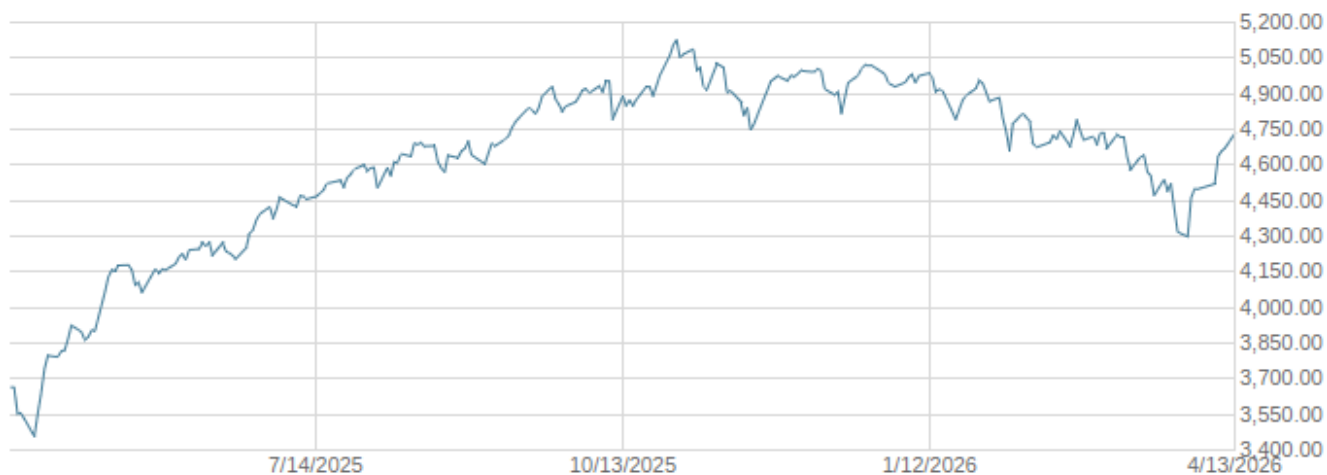
— Russell 1000 Growth TR USD Index