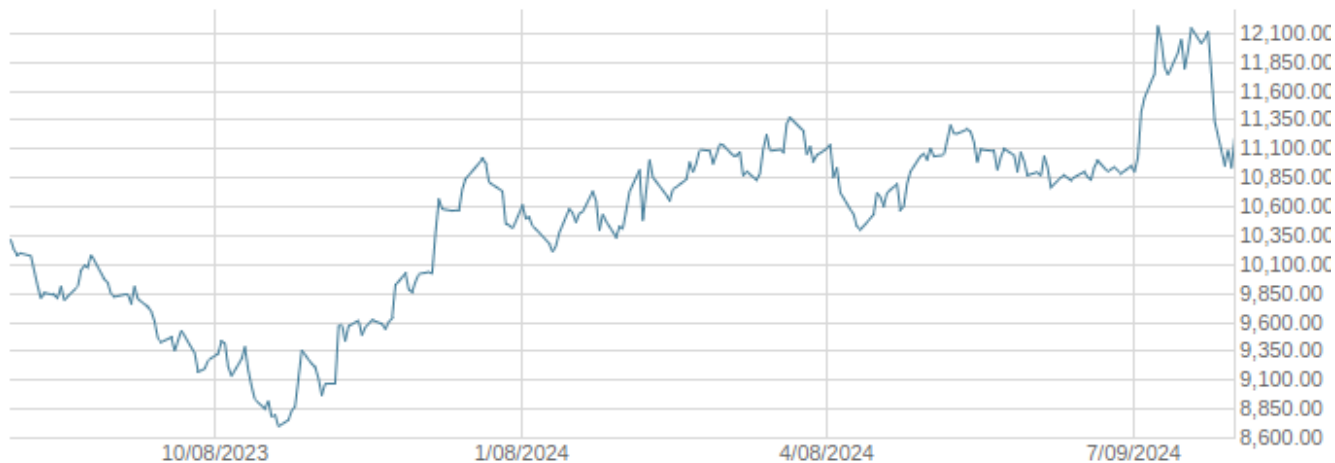
— Russell 2000 TR USD Index