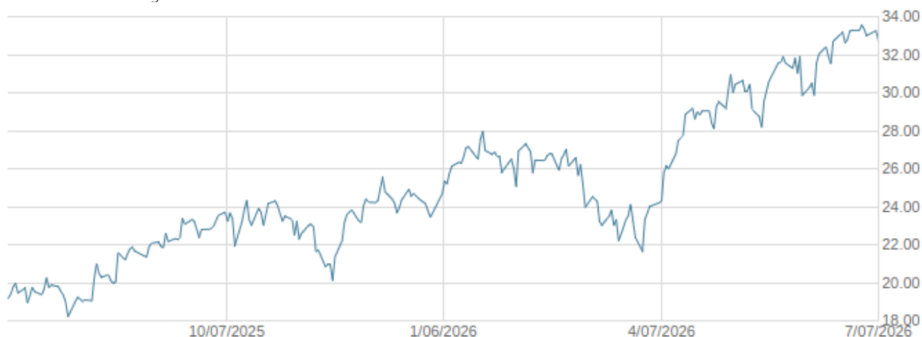
— ETRACS 2x Leveraged US Size Factor TR ETN

The above graph illustrates the historical indicative values of the ETN during the period selected. The indicative value is the approximate intrinsic economic value of the ETN as of a particular time and date. The actual trading price of the ETN may be different from its indicative value. The secondary market trading price of the ETNs may be at, above, or below the indicative value of the ETN. Historical performance of the ETN is not an indication of future performance of the ETN. Future performance of the ETN may differ significantly from its historical performance, either positively or negatively.