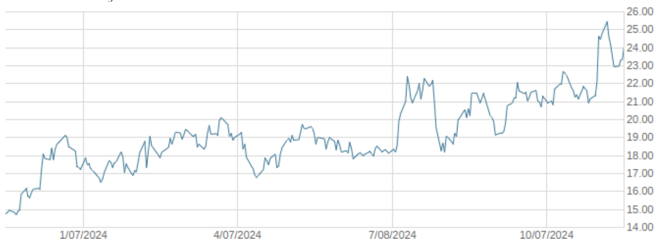
— ETRACS 2x Leveraged US Size Factor TR ETN

The above graph illustrates the historical indicative values of the ETN during the period selected. The indicative value is the approximate intrinsic economic value of the ETN as of a particular time and date. The actual trading price of the ETN may be different from its indicative value. The secondary market trading price of the ETNs may be at, above, or below the indicative value of the ETN. Historical performance of the ETN is not an indication of future performance of the ETN. Future performance of the ETN may differ significantly from its historical performance, either positively or negatively.