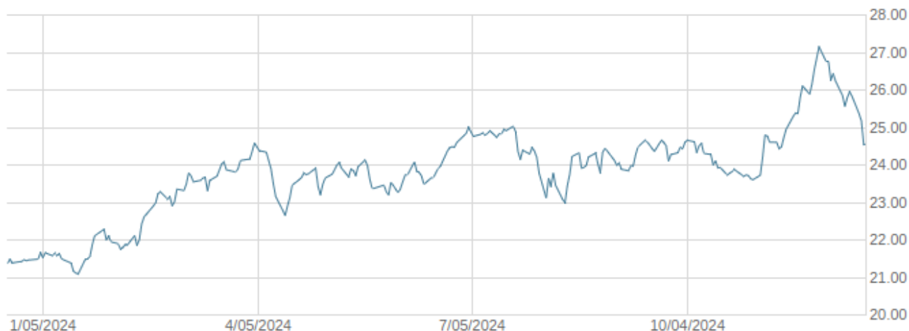
— ETRACS Alerian MLP Infrastructure Index ETN Series B

The above graph illustrates the historical indicative values of the ETN during the period selected. The indicative value is the approximate intrinsic economic value of the ETN as of a particular time and date. The actual trading price of the ETN may be different from its indicative value. The secondary market trading price of the ETNs may be at, above, or below the indicative value of the ETN. Historical performance of the ETN is not an indication of future performance of the ETN. Future performance of the ETN may differ significantly from its historical performance, either positively or negatively.