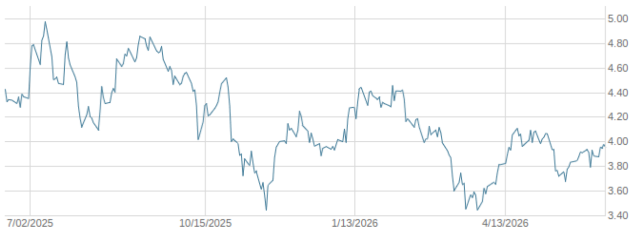
— ETRACS Monthly Pay 2xLeveraged US Small Cap High Dividend ETN Series B

The above graph illustrates the historical indicative values of the ETN during the period selected. The indicative value is the approximate intrinsic economic value of the ETN as of a particular time and date. The actual trading price of the ETN may be different from its indicative value. The secondary market trading price of the ETNs may be at, above, or below the indicative value of the ETN. Historical performance of the ETN is not an indication of future performance of the ETN. Future performance of the ETN may differ significantly from its historical performance, either positively or negatively.