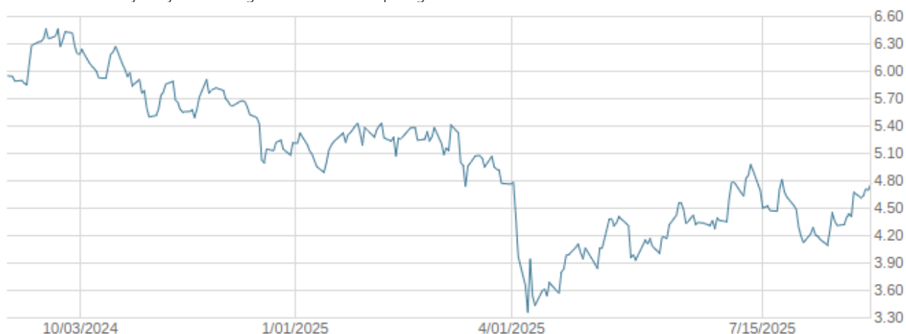
— ETRACS Monthly Pay 2xLeveraged US Small Cap High Dividend ETN Series B

The above graph illustrates the historical indicative values of the ETN during the period selected. The indicative value is the approximate intrinsic economic value of the ETN as of a particular time and date. The actual trading price of the ETN may be different from its indicative value. The secondary market trading price of the ETNs may be at, above, or below the indicative value of the ETN. Historical performance of the ETN is not an indication of future performance of the ETN. Future performance of the ETN may differ significantly from its historical performance, either positively or negatively.