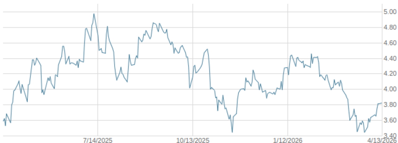
— ETRACS Monthly Pay 2xLeveraged US Small Cap High Dividend ETN Series B

The above graph illustrates the historical indicative values of the ETN during the period selected. The indicative value is the approximate intrinsic economic value of the ETN as of a particular time and date. The actual trading price of the ETN may be different from its indicative value. The secondary market trading price of the ETNs may be at, above, or below the indicative value of the ETN. Historical performance of the ETN is not an indication of future performance of the ETN. Future performance of the ETN may differ significantly from its historical performance, either positively or negatively.