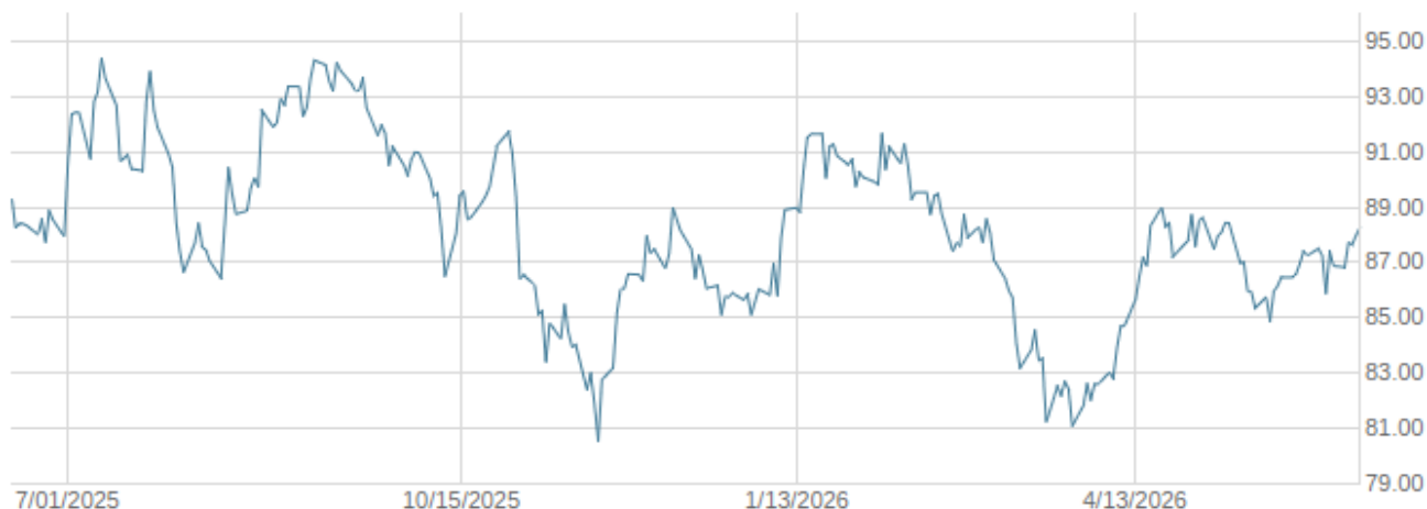
— Solactive US Small Cap High Dividend Index