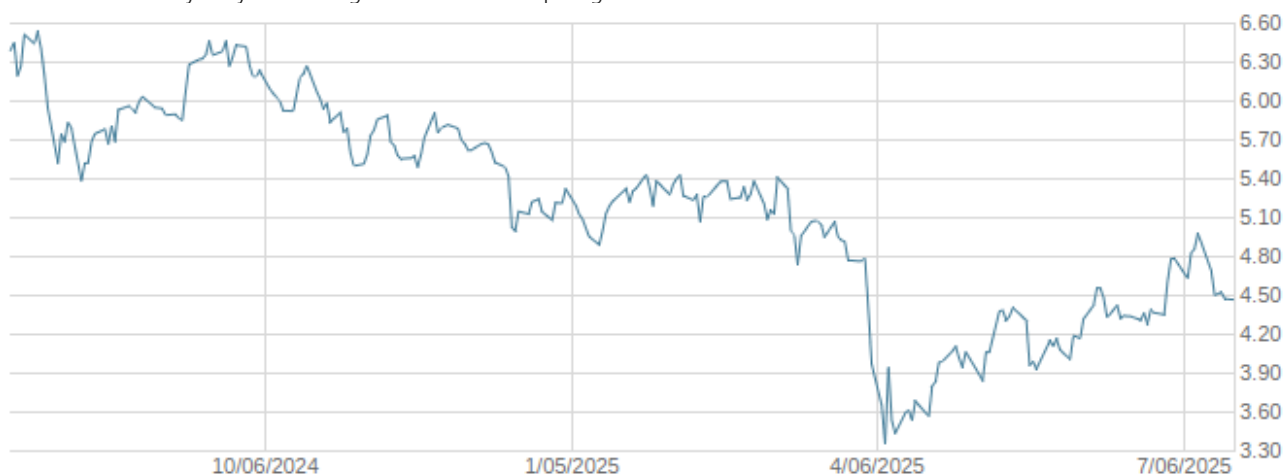
— ETRACS Monthly Pay 2xLeveraged US Small Cap High Dividend ETN Series B

The above graph illustrates the historical indicative values of the ETN during the period selected. The indicative value is the approximate intrinsic economic value of the ETN as of a particular time and date. The actual trading price of the ETN may be different from its indicative value. The secondary market trading price of the ETNs may be at, above, or below the indicative value of the ETN. Historical performance of the ETN is not an indication of future performance of the ETN. Future performance of the ETN may differ significantly from its historical performance, either positively or negatively.