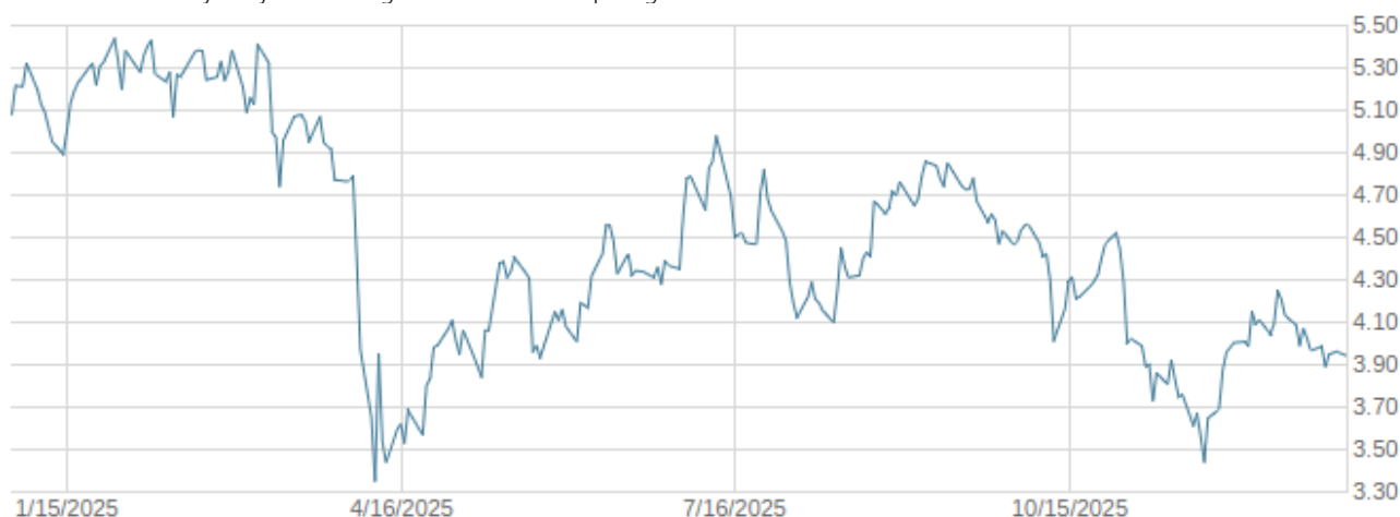
— ETRACS Monthly Pay 2xLeveraged US Small Cap High Dividend ETN Series B

The above graph illustrates the historical indicative values of the ETN during the period selected. The indicative value is the approximate intrinsic economic value of the ETN as of a particular time and date. The actual trading price of the ETN may be different from its indicative value. The secondary market trading price of the ETNs may be at, above, or below the indicative value of the ETN. Historical performance of the ETN is not an indication of future performance of the ETN. Future performance of the ETN may differ significantly from its historical performance, either positively or negatively.