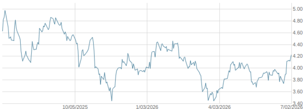
— ETRACS Monthly Pay 2xLeveraged US Small Cap High Dividend ETN Series B

The above graph illustrates the historical indicative values of the ETN during the period selected. The indicative value is the approximate intrinsic economic value of the ETN as of a particular time and date. The actual trading price of the ETN may be different from its indicative value. The secondary market trading price of the ETNs may be at, above, or below the indicative value of the ETN. Historical performance of the ETN is not an indication of future performance of the ETN. Future performance of the ETN may differ significantly from its historical performance, either positively or negatively.