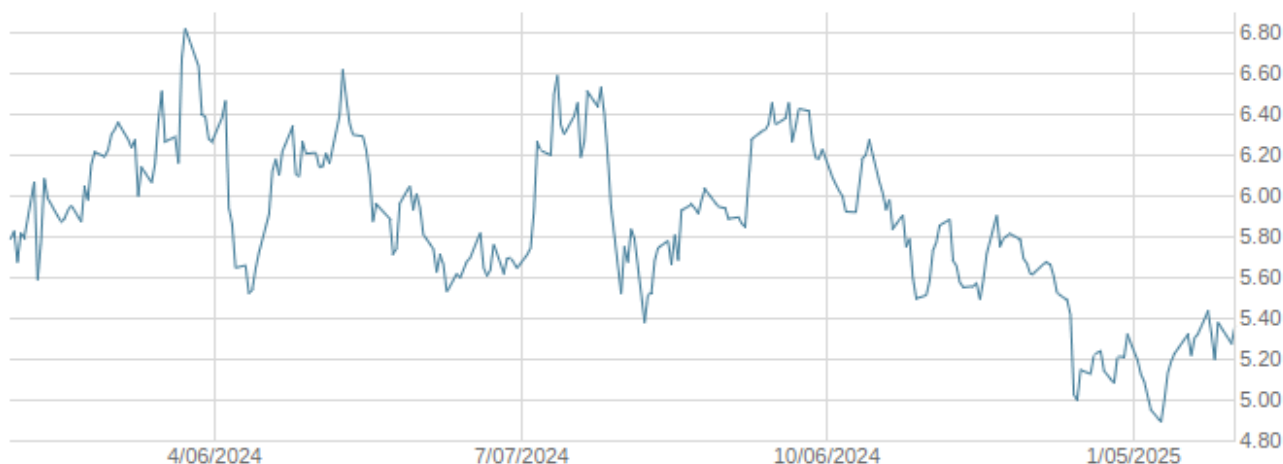
— ETRACS Monthly Pay 2xLeveraged US Small Cap High Dividend ETN Series B

The above graph illustrates the historical indicative values of the ETN during the period selected. The indicative value is the approximate intrinsic economic value of the ETN as of a particular time and date. The actual trading price of the ETN may be different from its indicative value. The secondary market trading price of the ETNs may be at, above, or below the indicative value of the ETN. Historical performance of the ETN is not an indication of future performance of the ETN. Future performance of the ETN may differ significantly from its historical performance, either positively or negatively.