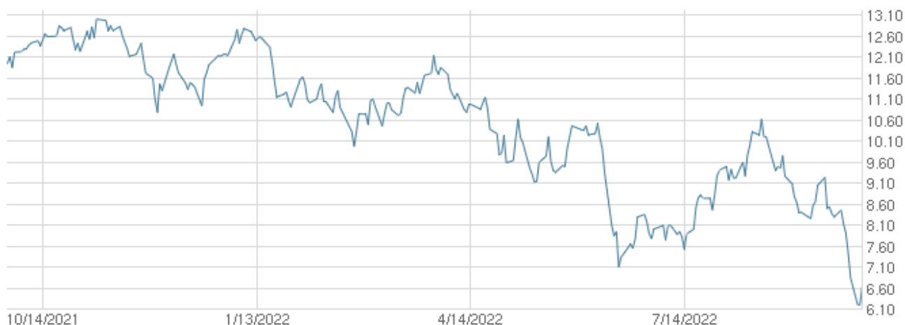
— ETRACS Monthly Pay 2xLeveraged US Small Cap High Dividend ETN Series B

The above graph illustrates the historical indicative values of the ETN during the period selected. The indicative value is the approximate intrinsic economic value of the ETN as of a particular time and date. The actual trading price of the ETN may be different from its indicative value. The secondary market trading price of the ETNs may be at, above, or below the indicative value of the ETN. Historical performance of the ETN is not an indication of future performance of the ETN. Future performance of the ETN may differ significantly from its historical performance, either positively or negatively.