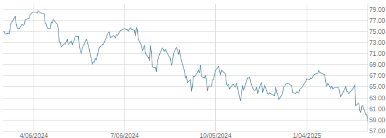
— ETRACS Crude Oil Shares Covered Call ETN

The above graph illustrates the historical indicative values of the ETN during the period selected. The indicative value is the approximate intrinsic economic value of the ETN as of a particular time and date. The actual trading price of the ETN may be different from its indicative value. The secondary market trading price of the ETNs may be at, above, or below the indicative value of the ETN. Historical performance of the ETN is not an indication of future performance of the ETN. Future performance of the ETN may differ significantly from its historical performance, either positively or negatively.