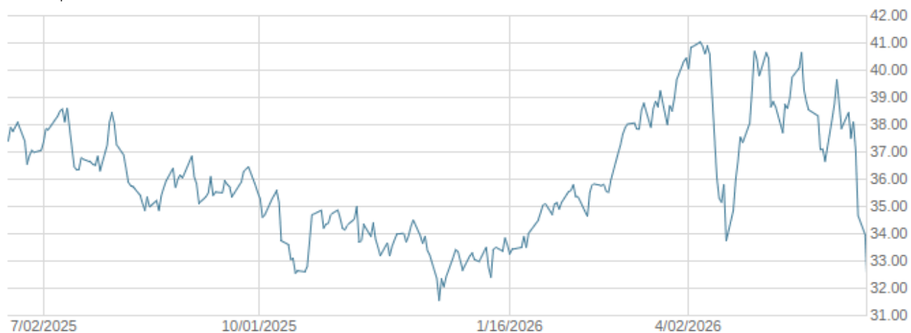
— Nasdaq WTI Crude Oil FLOWS™ 106 Index