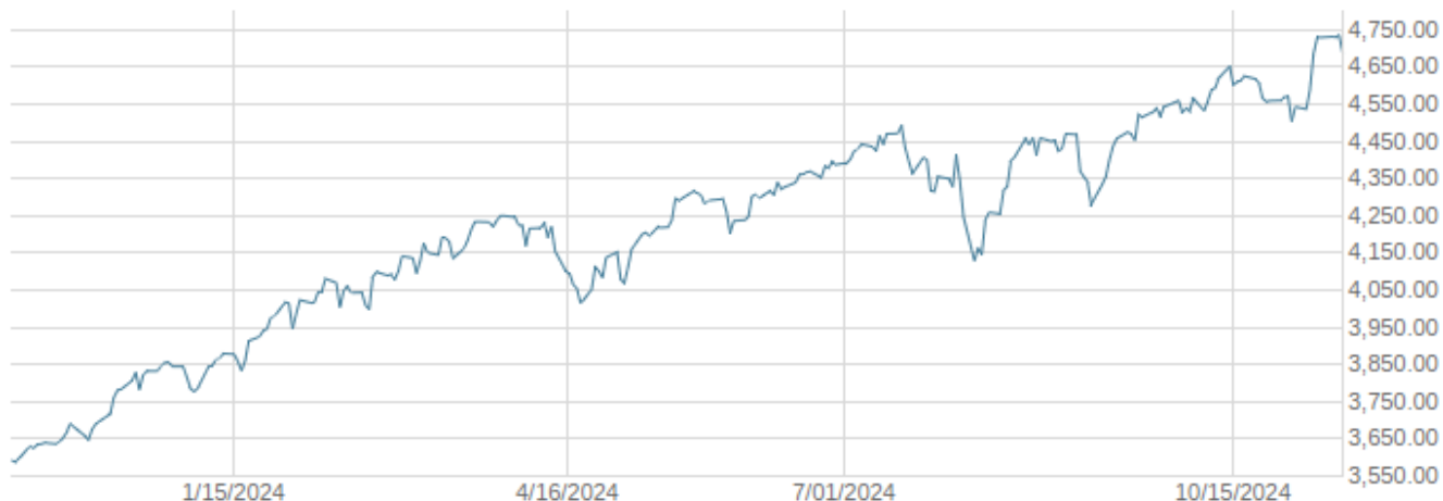
— Solactive Whitney U.S. Critical Technologies CNTR Index

Source: UBS Investment Bank, publicly available data.