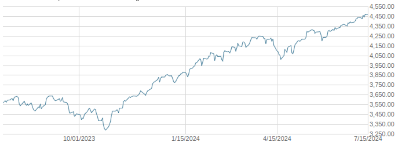
— Solactive Whitney U.S. Critical Technologies CNTR Index